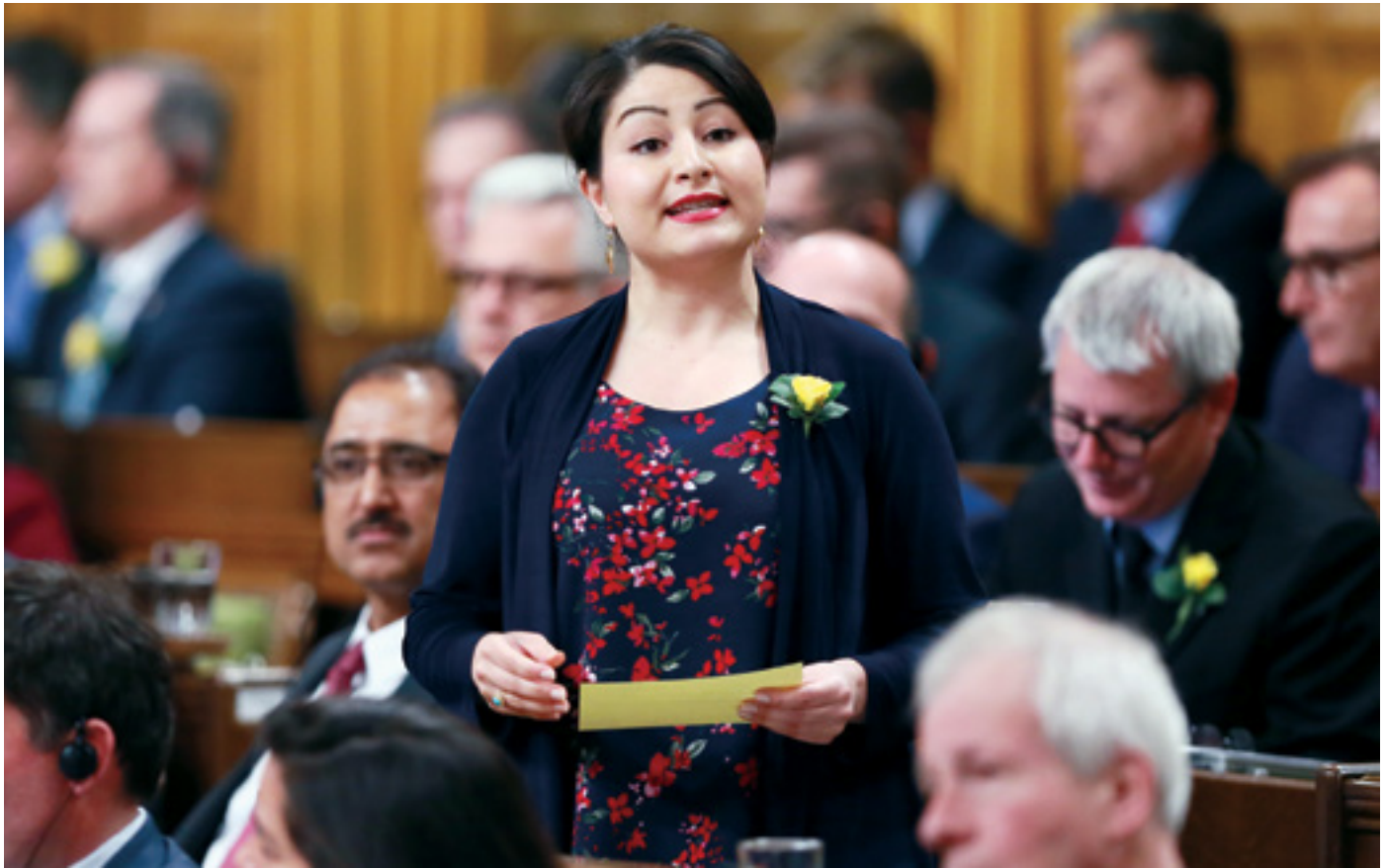
Monsef says that while Canadians are open to e-voting “the common theme across the country is ‘do not mess with the paper ballot.’”

for Canadians, and if at the end of the day we have an electoral system that doesn’t have their buy-in then why are we doing this?