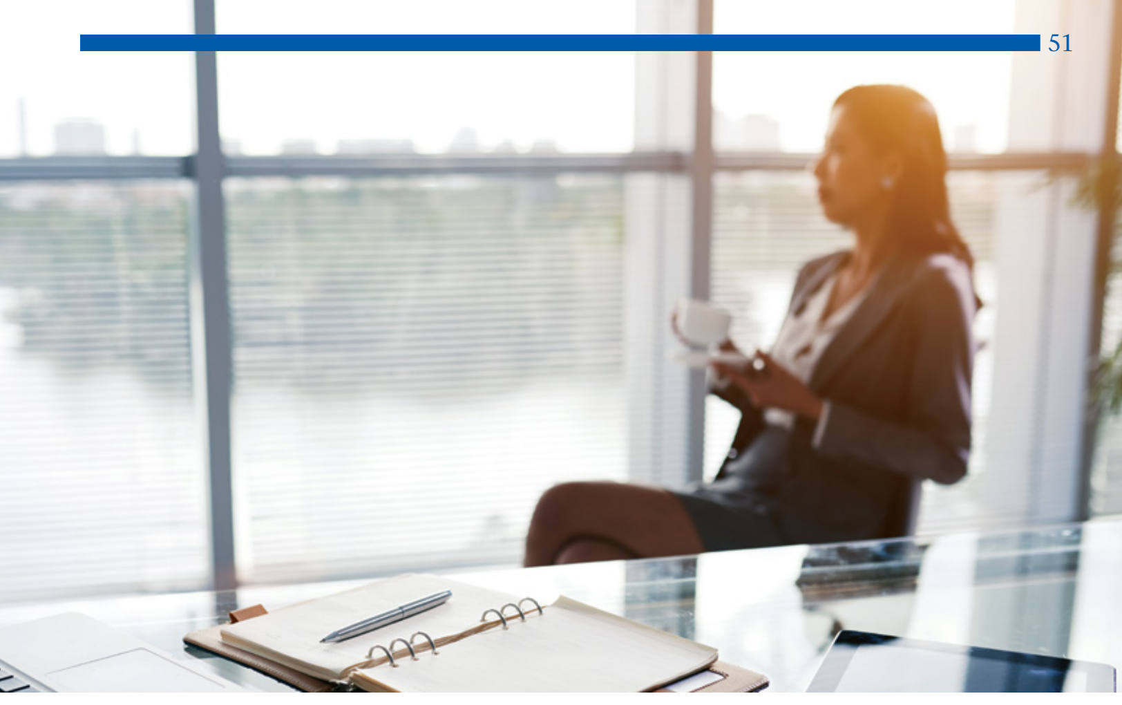
In the mid-1990s, writes University of Regina President Vianne Timmons, women accounted for only 18 per cent of Canadian university presidents. Two decades later, in 2016, the percentage has scarcely increased to just 23 per cent.